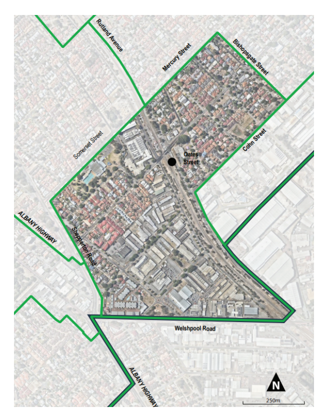
Figure 1. Local Planning Strategy – Oats Street Neighbourhood 10 boundary