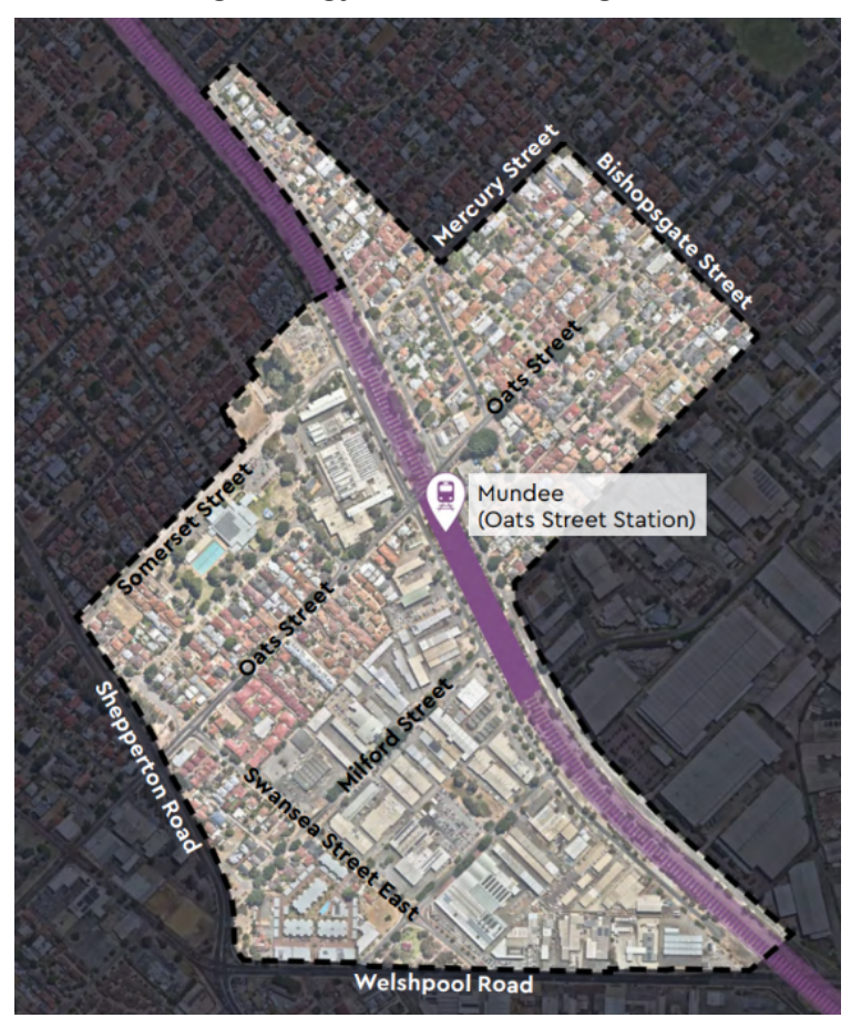
Figure 2. Oats Street Precinct - Preferred Growth Scenario Precinct (expanded) boundary

6. In December 2021, the Council approved the granting of easements to Western Power over Lot 121 and Lot 22 Shepperton Road and Lot 311 Somerset Street, East Victoria Park for the purpose of removing overhead power lines as part of the METRONET Level Crossing Removal project. The $347,000 (plus